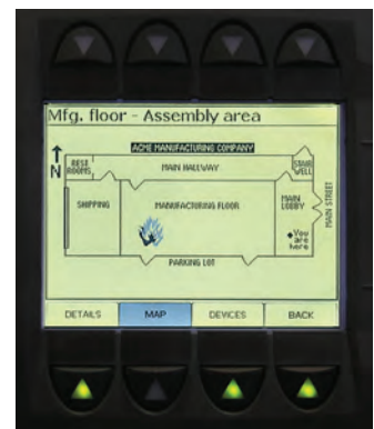
With clear graphics and intuitive prompts, the FireFinder XLS system interface delivers maximum ease of use.

Siemens Industry factory-authorized distributors can provide complete after installation support and services for your entire life safety system. Their factory-trained, certified technicians are backed by more than 60 years of proven innovation in designing and maintaining life safety systems. This means they are able to provide service for all of your life safety needs.